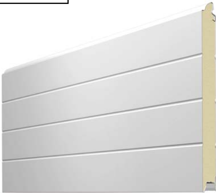
PARTICOLARE DEL GIUNTO